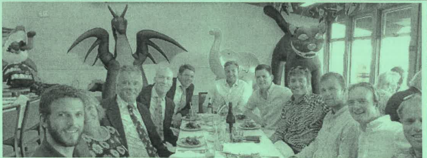
The Happy & Great British Team enjoying a fine dinner of Chilean Sea Bass or an overly large Pork Chop with delightful mustard sauce. In the background new inflatable marks. To Weather: The dragon with glowing eyes makes it easy to find. All competitors will have to cross the the start pin Bad Luck Black Cat (right). The inflatable land shark(on the left) is eating an spacially unaware yachtsman in neon green trousers.It' will fittingly be set as a jibe mark. No one wants to talk about the Elephant in the room

Will the boat leading at the very end of race actually go thru the finish line? Analysis does indeed prove that winning the practice race is indeed tend detrimentally to your chances of winning the regatta.