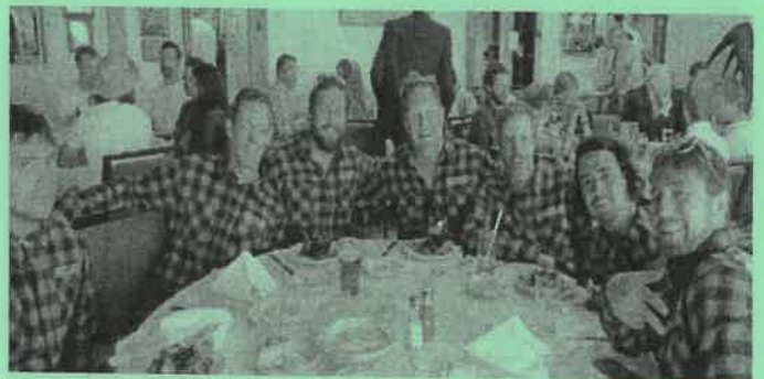
The Canadian Team dining in Lumberjack Regalia.