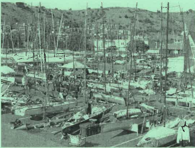
Funny 61 i-14s in the RYC dinghy park don't look like 1.83 mega love dollars