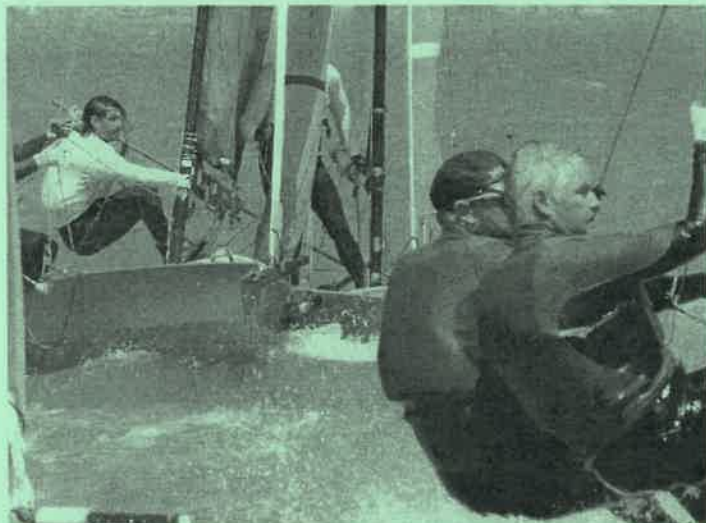
rack to hull at the weather mark

The breeze today well topped maybe at 15. The Sausage Triangle course was set more in the lee of Angel Island. 'Tis possible it might move South a little in the future --breeze depending. Flood tide held down the chop to a barely Jacuzzi jet. In other words it don't get too much better. Mark roundings were fun. Unless you were a tiny bit late port tacker at the weather mark & attempted a crash tack. And speaking of crashes the whalers were engaged mostly for standing by.