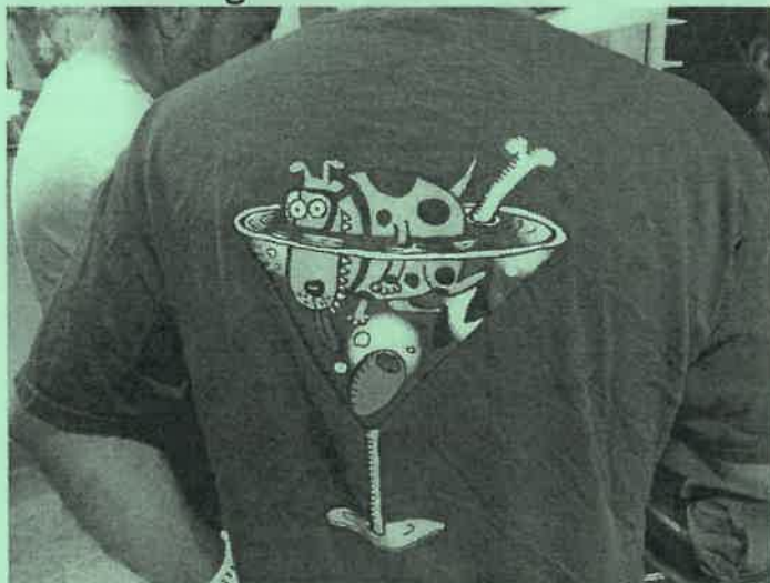
A Happy Martini swilling dog