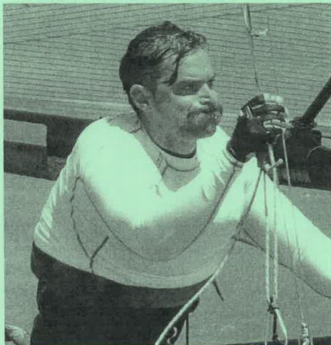
A little rack to hull reaction

The breeze today well topped maybe at 15. The Sausage Triangle course was set more in the lee of Angel Island. 'Tis possible it might move South a little in the future --breeze depending. Flood tide held down the chop to a barely Jacuzzi jet. In other words it don't get too much better. Mark roundings were fun. Unless you were a tiny bit late port tacker at the weather mark & attempted a crash tack. And speaking of crashes the whalers were engaged mostly for standing by.